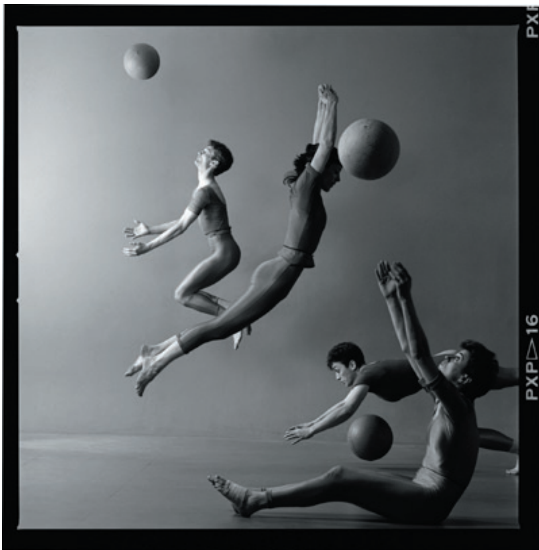
Elizabeth Streb Dance Company 1985

Those who photographed dancing early in the century rarely tried to shoot dancers in action. Public taste, taste in photography, and the nature of the equipment and techniques available tended to produce pictures of dancers as