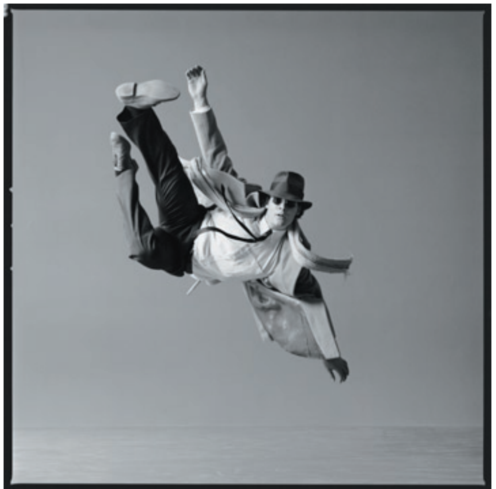
David Parsons 1983

In one well-known image, David Parsons, decked out modishly in sports jacket, tie, scarf, hat, and sun glasses, floats perilously close to the ground with his torso horizontal, his arms spread wide, and his feet kicked up far above his head. It’s hard to say if he’s still taking off or about to crash unceremoniously, but we certainly admire his incredible act of levitation.