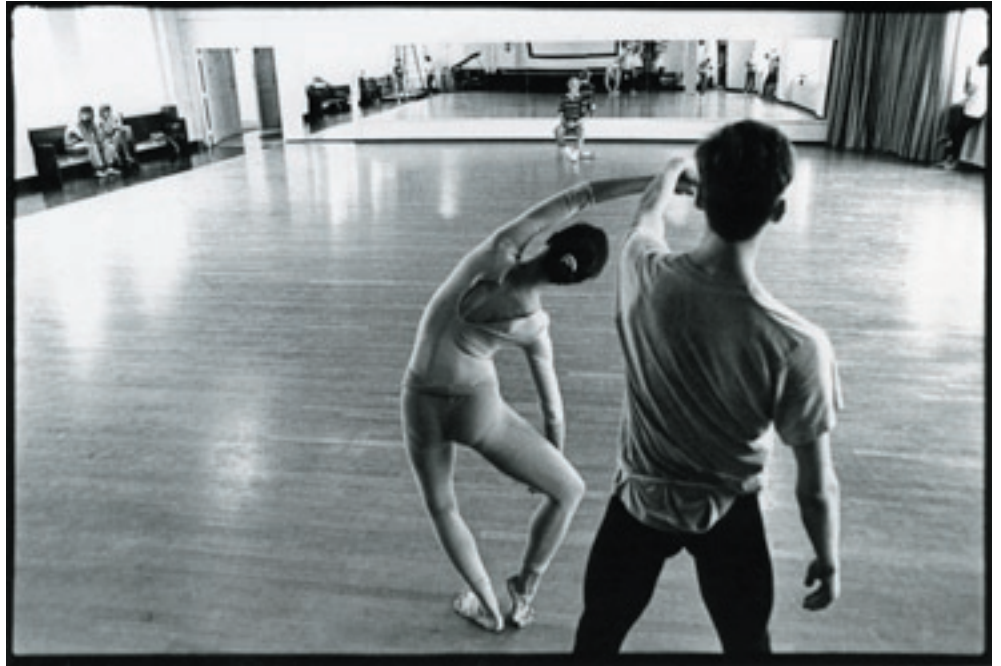
Merce Cunningham in rehearsal, 1986