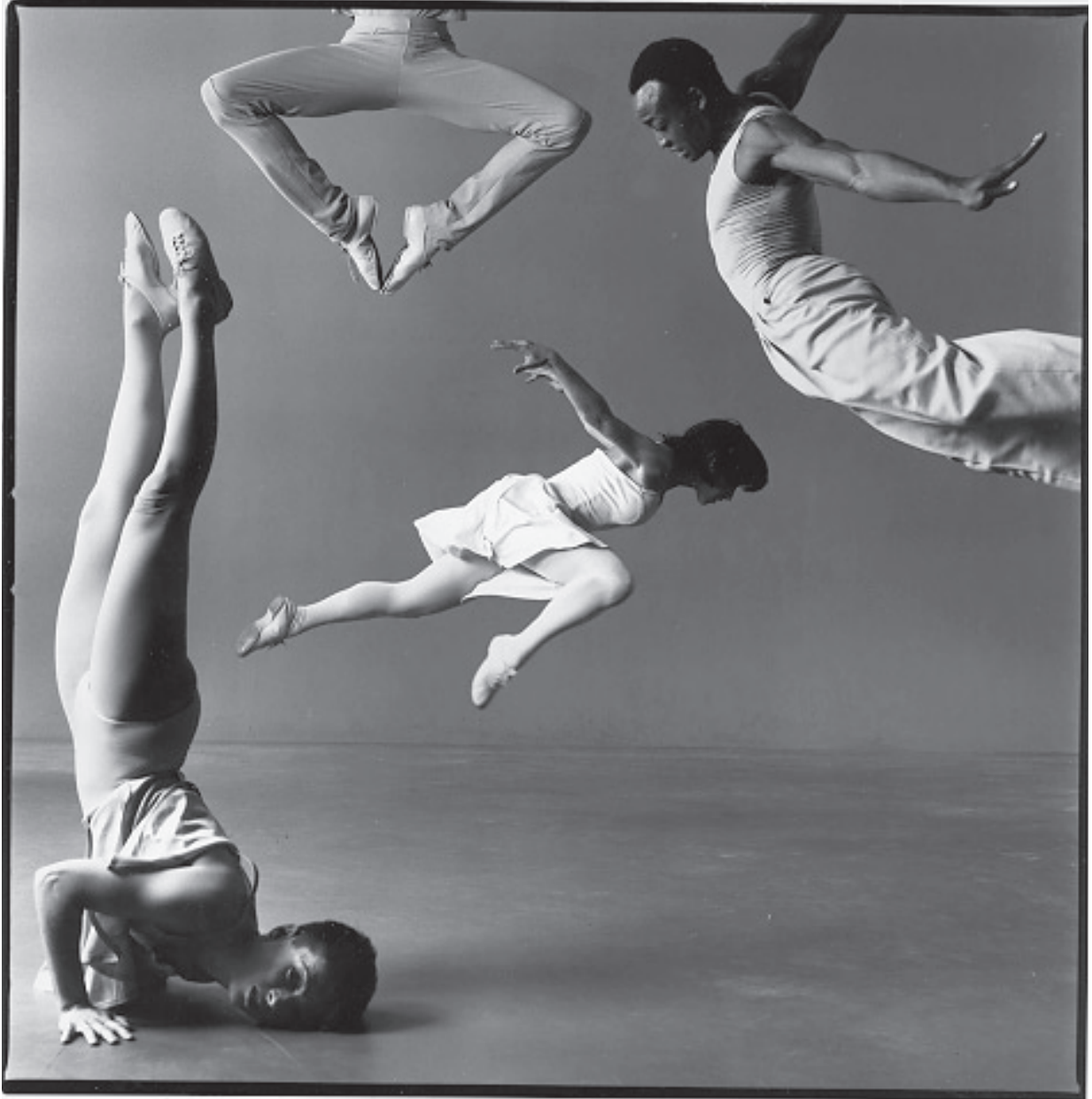
Bill T. Jones and Arnie Zane Dance Company 1983

Exhibition organized by The Rosenwald-Wolf Gallery The University of the Arts Philadelphia, Pennsylvania October 16 - November 13, 1987