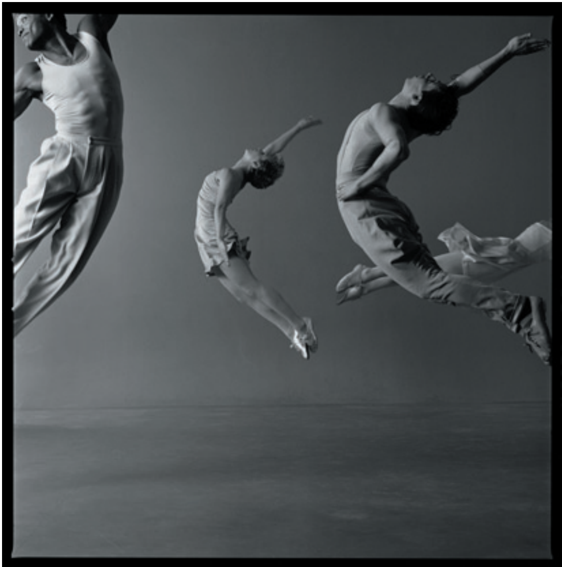
Bill T. Jones and Arnie Zane Dance Company 1983

Company, two figures, one male and one female, sweep from left to right, each in a magnificent arc, while another man, closer to the camera and clipped by the edges of the frame, sails in from the left and a headless woman soars out of the frame to the right. The dynamism of motion suspended and balanced so precariously is breathtaking.