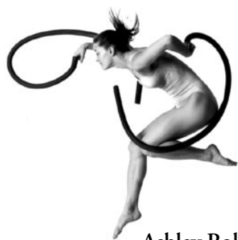
Ashley Roland 1995

We photographed this improvisational moment after a session shooting repertory. We recombined signature movements from Graham dances to make it look like a multiple exposure of one jump seen at three points. I rely on the dancers' ability to visualize their exact position in the air. What is so interesting about working with dancers whose bodies have been formed by discipline such as Graham's is that however they improvise, they still capture something of the choreographer's distinctive style.